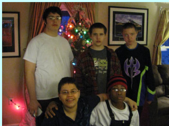
Shannon House Boys around the Christmas tree.

It is a family where a lot of caring FOCUS staff work hard to help five boys overcome the past and create a future.