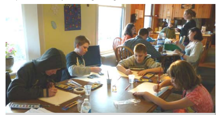
Experimenting with water colors