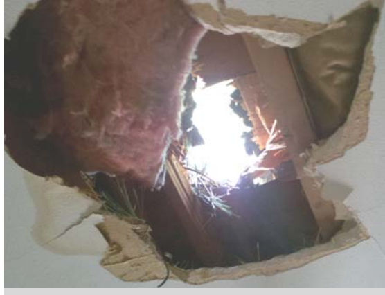
Roof damage where tree limb fell

For the staff and residents of our young adult therapeutic housing program in Simsbury the October storm was a time they will never forget. The loss of power, coupled with some pretty extensive damage to the house, including a branch through the roof into a resident's bedroom, forced the whole program to pick up and move to the Simsbury emergency shelter in the high school. The warm welcome they received there will always be remembered and the fact that the residents were given their own classroom made the transition and operation of the program much more manageable. The eight days spent in the shelter actually offered a rich social environment that the program residents seemed to enjoy. All the shelter volunteers were very supportive and many new friendships were forged as the community hunkered down together and waited out the devastation and loss of power.