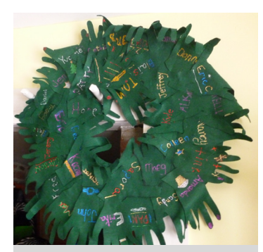
Felt hands wreath