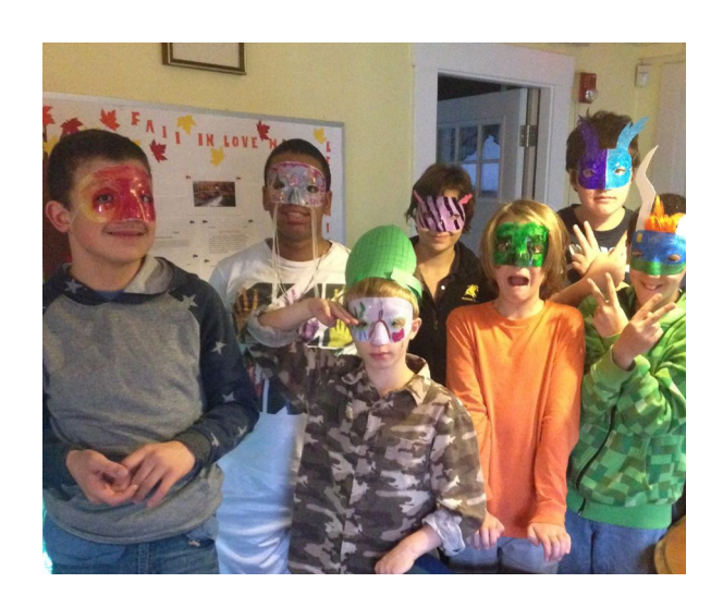
Above: FOCUS on the Arts celebrates Halloween

We are so thankful for your support! Keep an eye on our website for more information about this year's Festival for Autism!