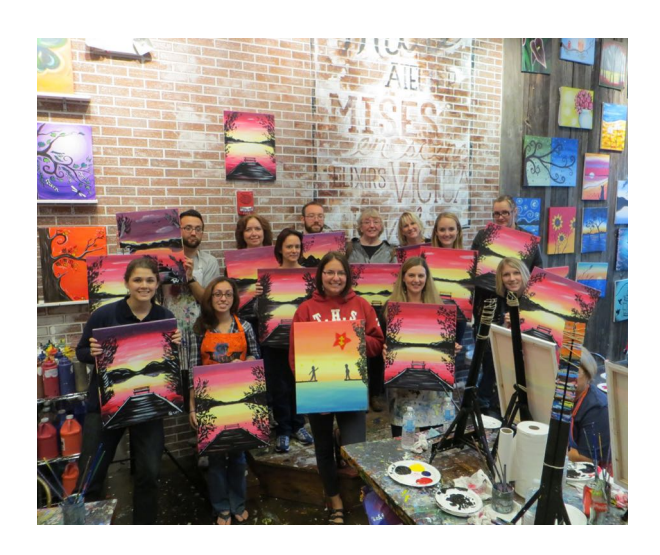
Above: FOCUS and friends at "Paint for a Cause"!