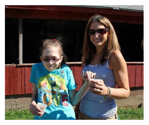
Above: FOCUS at Flamig Farm