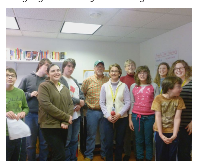
Above: FOCUS with Farmington Valley Trout Unlimited!