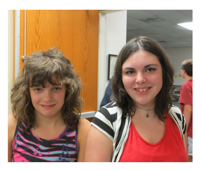
Above: Friends socializing at our Fall Party!