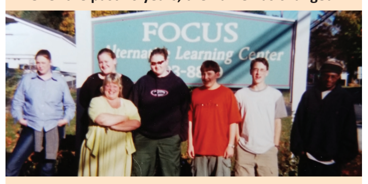
but the FOCUS has always been on the kids!