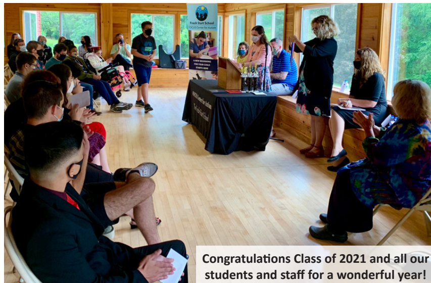
Congratulations Class of 2021 and all our students and staff for a wonderful year!