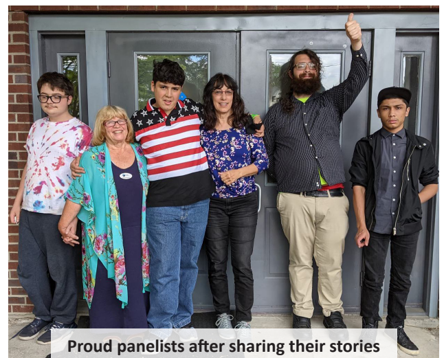
Proud panelists after sharing their stories