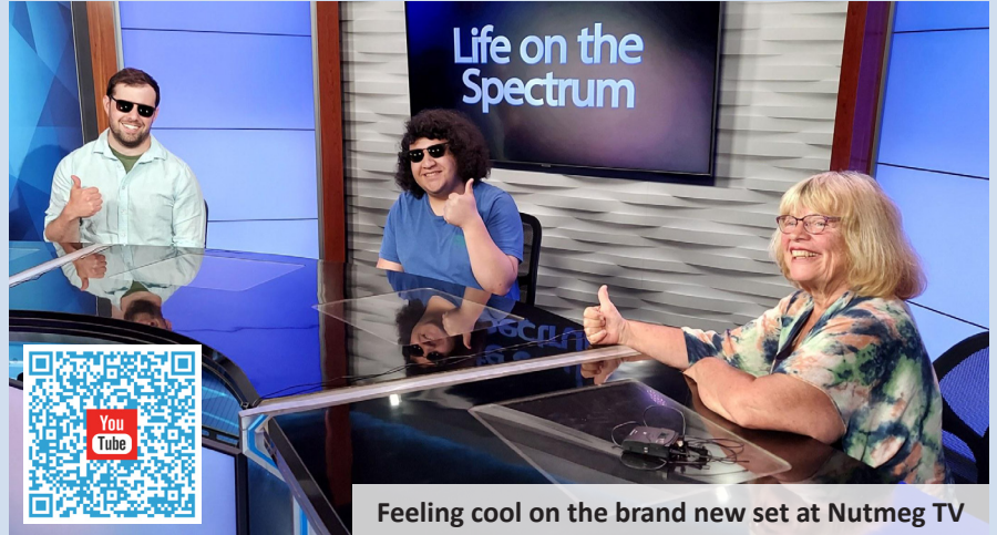
Feeling cool on the brand new set at Nutmeg TV

Scan the QR Code to the right or visit www.youtube.com/user/NutmegTelevision to see all available episodes!