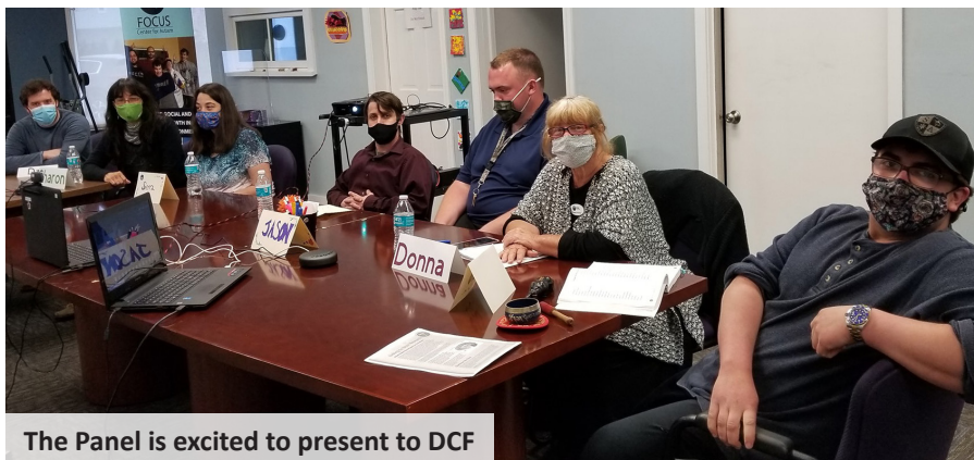
The Panel is excited to present to DCF

Making a difference one voice at a time! The FOCUS Autism Spectrum Unplugged held a three-course series of presentations for DCF. Participants in the course learned firsthand about autism, anxiety, the effects of trauma, and the strategies to help manage them. Our panelists, comprised of professionals, clinicians, and people with autism, shared their experiences, talked about the power of relationships, how to recognize anxiety symptoms, and what strategies work best for them. DCF participants shared feedback, "Your panelists were insightful, open, and honest, which was refreshing and made the class much more personal." and, "I thought the young men on the panel did a wonderful job at articulating what life is like for them, obstacles, and their own individual strengths." We are so proud of our panelists for sharing their stories to help educate others!