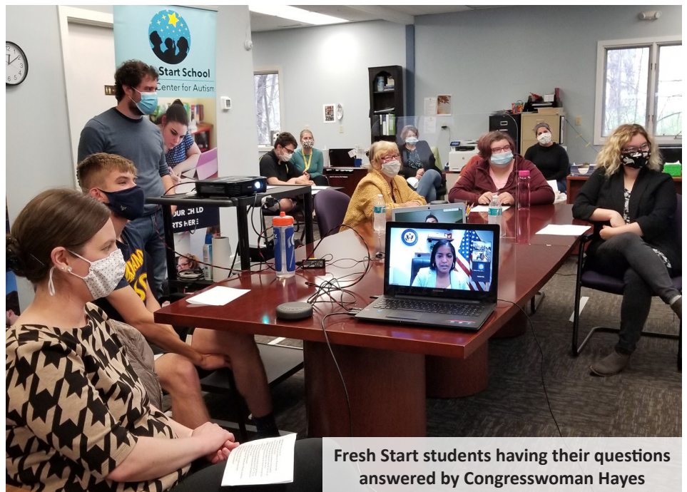
Fresh Start students having their questions answered by Congresswoman Hayes

Fresh Start School had the honor to speak with Congresswoman Jahana Hayes. The former National Teacher of the Year and current U.S. Representative for Connecticut's 5th congressional district virtually visited Fresh Start students and staff. Our students came up with a set of thoughtful questions about her career, policies, and current events. She took the time to answer each question and learn about our school and students. The conversation was insightful and inspiring! The meeting left us feeling grateful to have a U.S. Representative that is genuinely passionate about students and their education.