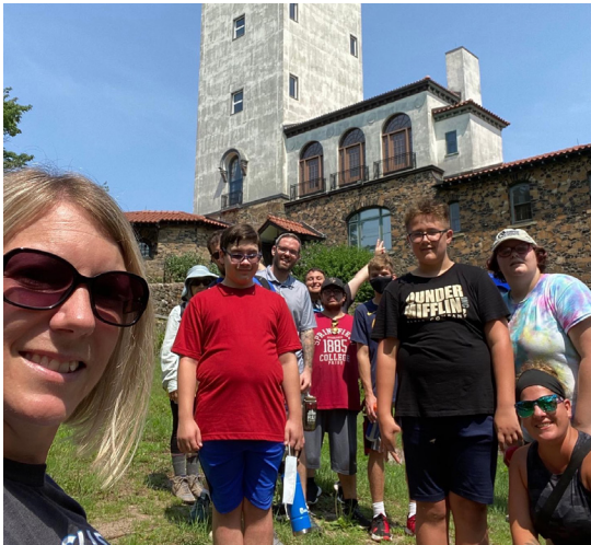
Hike up Talcott Mountain to Heublein Tower

We were very excited to be able to be in person once again for our Extended School Year/Summer Program! There were lots of fun activities including music, science, arts/crafts and field trips. Students stayed active during our outings going on hikes and swimming. We also had a few special guests this year including the Horizon Wings Raptor Rehabilitation center with Atka the bald eagle and other birds of prey. It was a great summer!