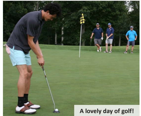
A lovely day of golf!