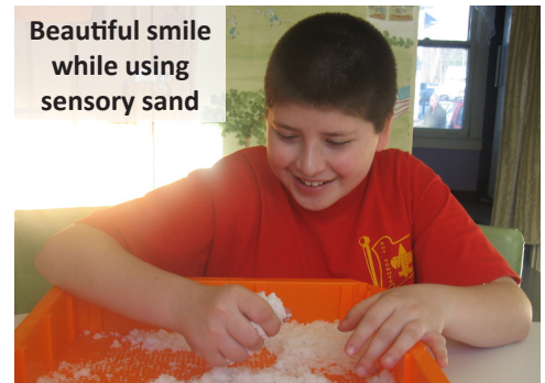
Beautiful smile while using sensory sand