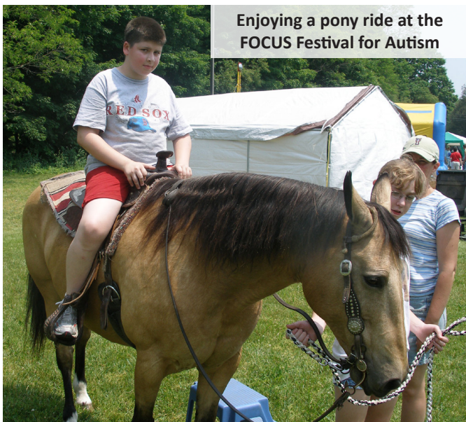
Enjoying a pony ride at the FOCUS Festival for Autism