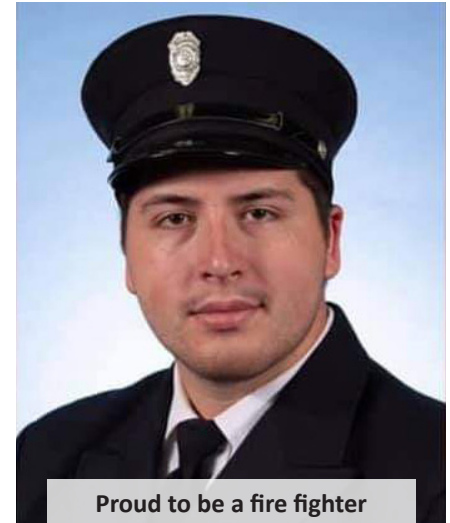
Proud to be a fire fighter