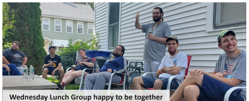
Wednesday Lunch Group happy to be together