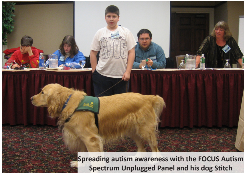
Spreading autism awareness with the FOCUS Autism Spectrum Unplugged Panel and his dog Stitch