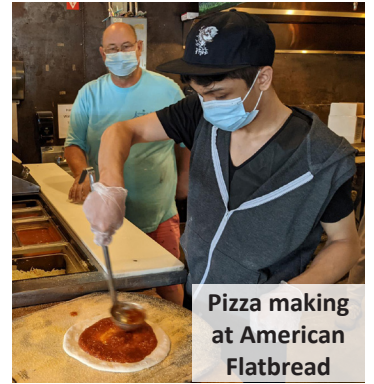
Pizza making at American Flatbread

The beginning of the new school year is off to a great start. We have said goodbye to some students and staff and welcomed in some new ones as well. Our transition program is excited to be able to venture out more into the community for job placements. This year we are continuing placements with Shepard Meadows Equestrian Center, Faith & Fire Forge, and Mack & Molly's Pet Parlor. We have also started a new placement at American Flatbread where students will learn skills needed to work in a restaurant setting. Classes for our younger students at the Dowd building are off and running and our students and staff are so happy to be back! We are looking forward to an exciting new year and to learning new things!