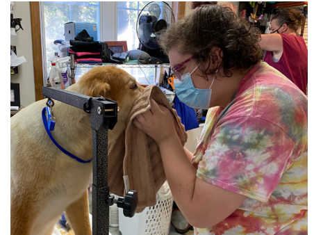
Helping out at Mack & Molly's