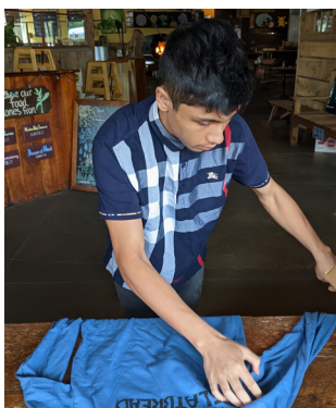
Folding American Flatbread merchandise