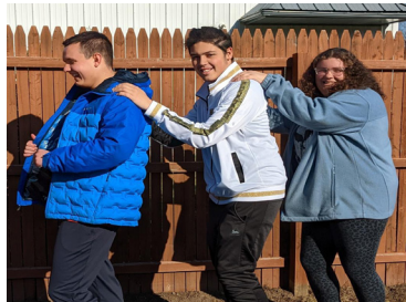
Post Thanksgiving feast dance party

Our school gathers as a community and shares meals, laughter, friendship, and a tradition of sharing what we are thankful for. And this year, we had a dance party!