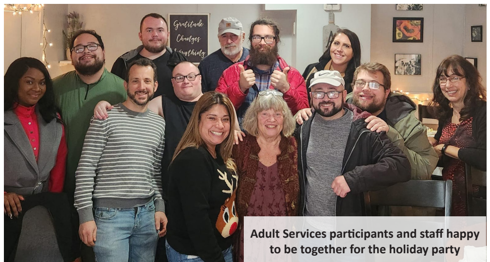
Adult Services participants and staff happy to be together for the holiday party

We were happy to have our Adult Services holiday party for the first time in 2 years! It was at the Cobblestone Restaurant in Torrington and everyone was so appreciative of being together. Attitudes of Gratitude Abound!