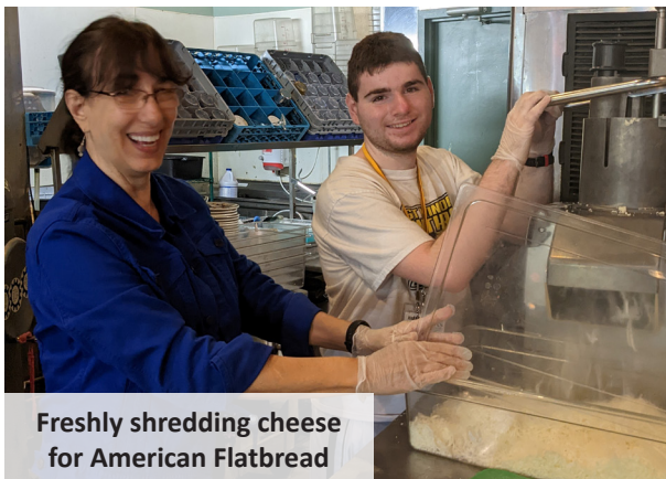
Freshly shredding cheese for American Flatbread

The Transition Program is looking for more job opportunities and new experiences to meet the diverse interests and skills of our students. If you own or know of a business that would like to collaborate, please email info@focuscenterforautism.org or call 860-693-8809.