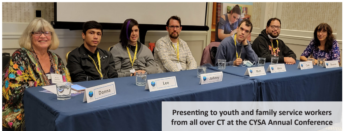
Presenting to youth and family service workers from all over CT at the CYSA Annual Conference

The FOCUS Autism Spectrum Unplugged provides a variety of unique perspectives on how to best meet the needs of those living with autism, anxiety, trauma, and sensory disorders. The panel presented at the Connecticut Youth Services Association annual conference to a group of professionals who provide different services to youth across our state. It was a powerful presentation that helped shape new perspectives for our audience members!