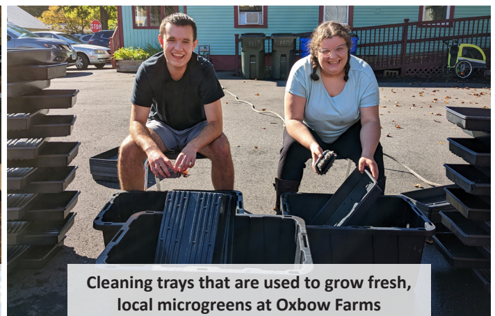
Cleaning trays that are used to grow fresh, local microgreens at Oxbow Farms