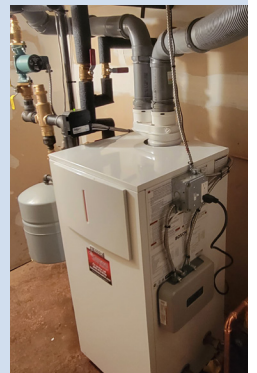
New high efficiency natural gas boiler

If you know of a corporation that may be interested in contributing to this year's energy conservation project and receiving a 100% tax credit, please email eric.cohen@focuscenterforautism.org or call (860)693-6127.