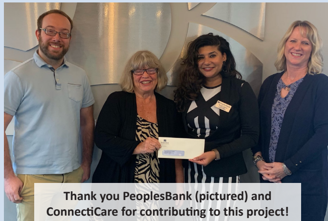
Thank you PeoplesBank (pictured) and ConnectiCare for contributing to this project!

Thanks to generous grants from PeoplesBank and ConnectiCare and help from Homestead Comfort and CNG, FOCUS Center for Autism was able to recently upgrade from an aging oil boiler and leaking oil tank to a new 95% efficient natural gas boiler! This was part of the State of Connecticut's Neighborhood Assistance Act that allows for corporations to receive a 100% tax credit for contributions to energy conservation projects like this one. Not only does switching to natural gas reduce FOCUS' carbon footprint, but also helps to save money on utility expenses!