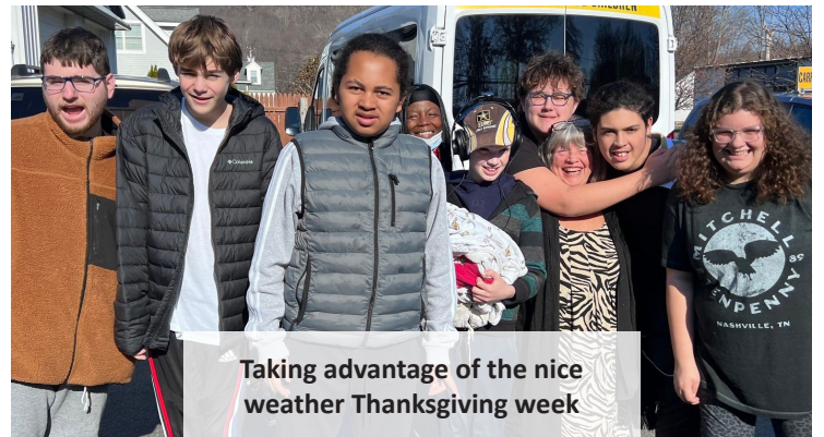
Taking advantage of the nice weather Thanksgiving week

All of us at FOCUS are grateful for our community that continues to grow!