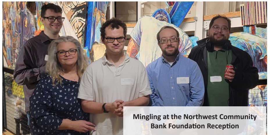
Mingling at the Northwest Community Bank Foundation Reception

FOCUS is thankful for all the support we receive from the community!