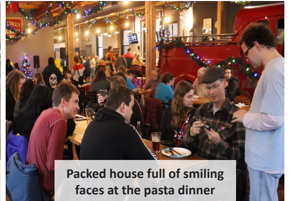
Packed house full of smiling faces at the pasta dinner