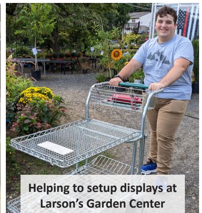
Helping to setup displays at Larson’s Garden Center